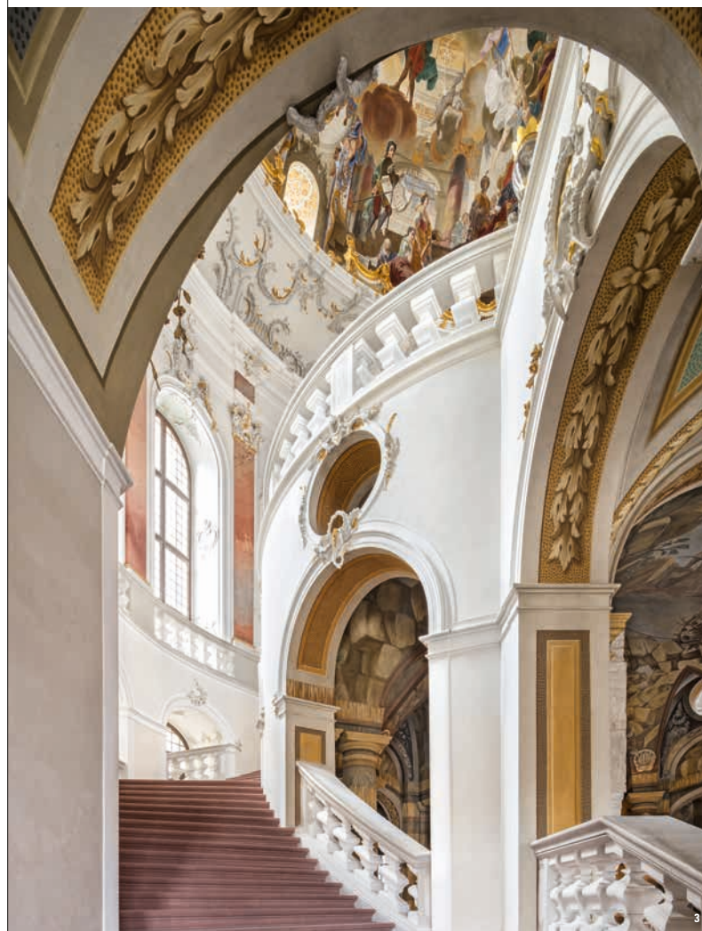
👑🏰 Top: an elegantly winding staircase, constructed in Balthasar Neumann's signature style

Visitors entering Bruchsal Palace's cour d'honneur (three-sided grand courtyard) are greeted by a splendid and colorful sight. The buildings are richly ornamented with stucco and paintings, the eaves decorated with golden dragon gargoyles. From 1728 on, the famous architect Balthasar Neumann built the magnificent staircase , "unrivalled in the ingenious uniqueness of the palace and high degree of spatial poetry". From the dark netherworld, astonished visitors are—still today—conducted up into shining heights. Rarely has the ascending of a grand staircase provided so many fascinating insights and prospects! Schönborn's successor, Franz Christoph von Hutten, completed Bruchsal Palace with the sumptuous decoration of the Princes' and Marble Hall while providing the staterooms in the Bel-Étage with elegant stucco and exquisite furniture.